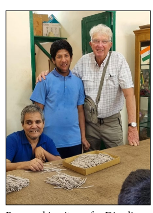
Busy making items for Diwali

The campus was looking spectacular with its familiar rusty red paintwork against the beautiful Sal trees' back drop. The gardens are blooming. The