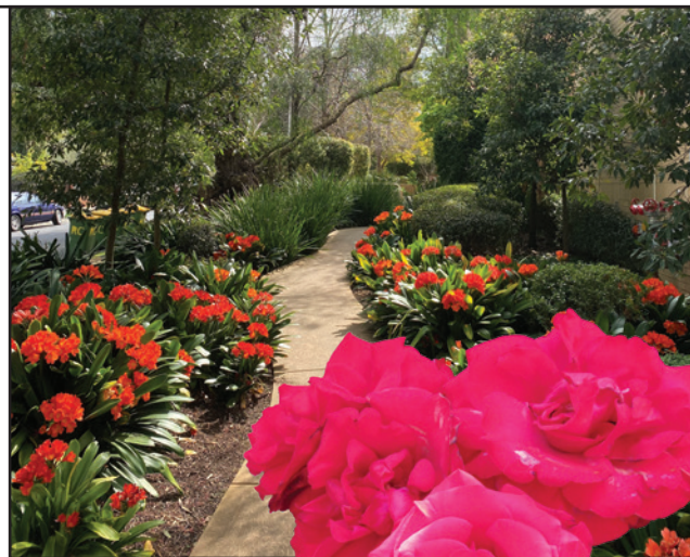
The gardens in bloom