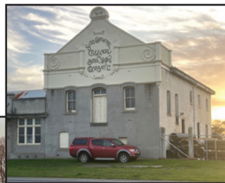
◀ South Gippsland Creamery and Butter Factory

Entering the township, the road widens into an attractive boulevard with a central garden display. Yarram has its own share of historical buildings including the Regent Theatre and Yarram Courthouse now a gallery and art space. The art space extends to colourful murals to be seen around the town on the sides of various buildings. Painted by street and silo artist Heesco, they depict a number of historical figures and an attraction for visitors.