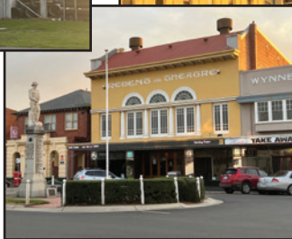
◀ Regent Theatre