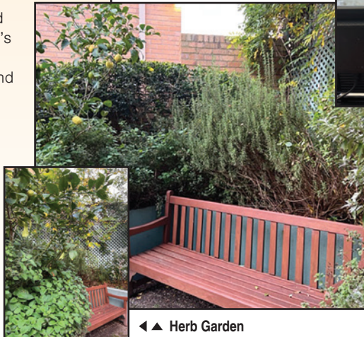
◀ ◀ Herb Garden