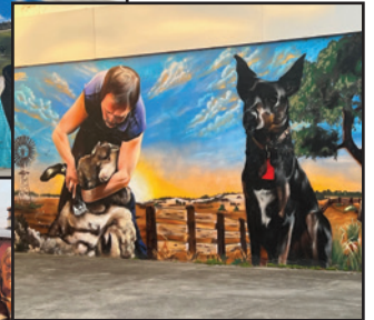
◀ Yarram Street Art

For recreation spaces Yarram offers a picnic area just off the highway to the north of the town based around the old bridges over the Tarra River waterway. To the south the town's Memorial Gardens also feature water attractions and a playground.