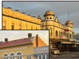
▲ Old Yarram Club Hotel