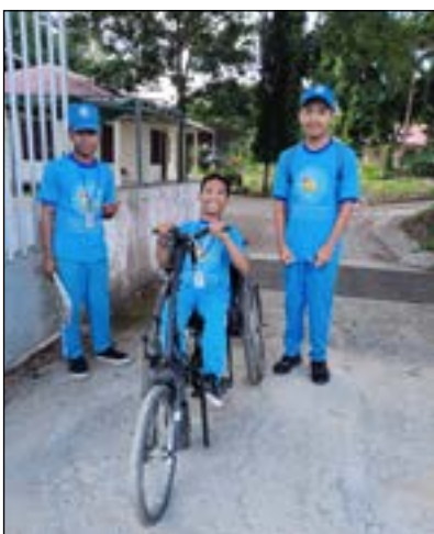
Off to school Uma Garton students