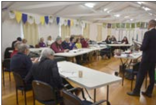
Biennial Conference in Hut 48 Ballarat Airport