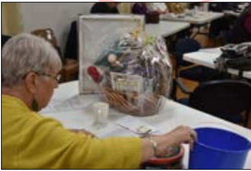
Betty BSG raffle