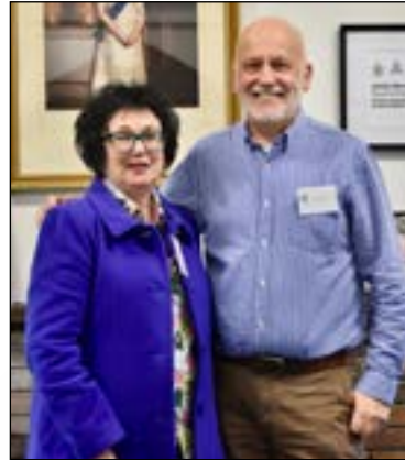
Dianne BSG with Rick BSG photographer