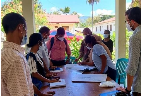
WHO Regional Green Light Committee visiting MDR-TB patients