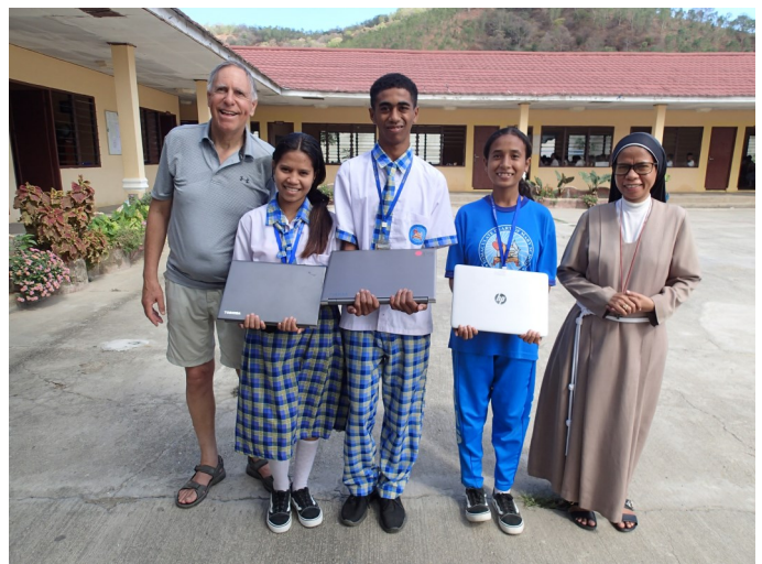
Refurbished laptops received with thanks.

The students are extremely grateful for both financial and physical support (and, as you will see from the letter right, a personal request from one of the disability students intending to go to University).