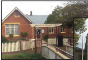
▲ Primary School circa 1874 ▶ Town Hall ▼ St Paul's Anglican Church

The main buildings of historical interest are found dispersed around the township including several churches and municipal buildings. Each is within walking distance of the other. One of the most significant buildings is the Lock-