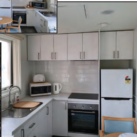
▲ Kitchen Renovation ◀ Don Sinclair House