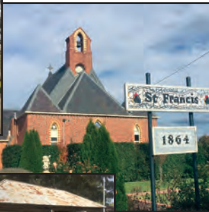
▲ St Francis Church 1864 ◀ Log Lock-up