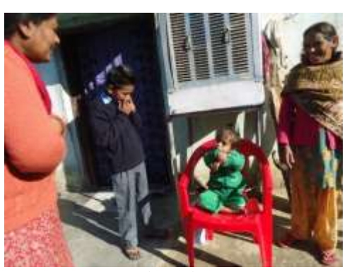
Catching them young

positive impact of early intervention on children in the age group of 0 to 6 years, the local primary school in Mehuwalahas given us a room to conduct the early in tervention programme where 8 children in the age group of 0-6 years attend regularly.