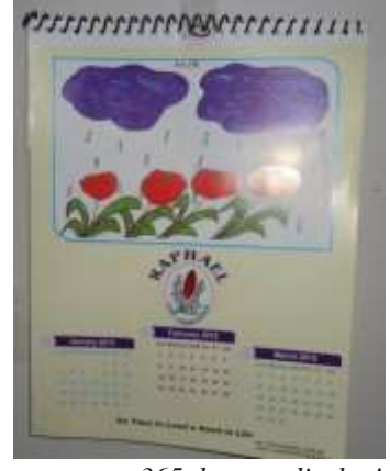
365 days on display!

All of us at Raphael wish you an eventful and a Happy New Year. With a fond farewell to the past year with its good and not so good we hope for better days, and new resolutions to keep. We have started the year with a 2015 calendar designed by our talented residents of Raphael.The calendar with its drawings and paintings by the budding artists are soon to adorn the walls and classes of Raphael. Certainly a good start to the New year.