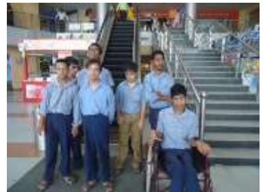
Boys out to sensitize the public

A Community Exposure Programme has been initiated by the Special Education Wing to sensitize the local community when the intellectually disabled mingle with the community. The children's first big exposure was at the Big Bazaar, a large market place