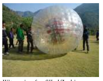
Witnessing fun filled Zorbing

instructors moved to Maldevta for an exciting two days of adventure filled experience. River crossing with a strong current, single rope Bridge crossing, Jungle walks / Trekking and self survival cooking on twigs collected from the forest grounds was an