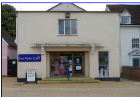
THE SUE RYDER CHARITY SHOP AT CAVENDISH, JULY 2011.

It is in this sense – with a heavy emphasis on volunteering – that “Sue Ryder” has worn the unmistakable mark of its founder for more than half a century. Volunteers and support groups really are the lifeblood of “Sue Ryder”. “Sue Ryder” charity shops, to be found in many towns throughout Britain, also have a social aspect - providing as much support and meaning to the volunteers as to those the volunteers are helping