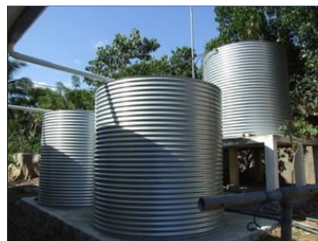
THE NEW KD WATER TANKS

have lunch in Dili with the other Australian volunteers. This always provided a nice