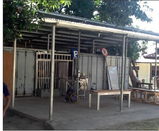
Roof over Generator and Containers