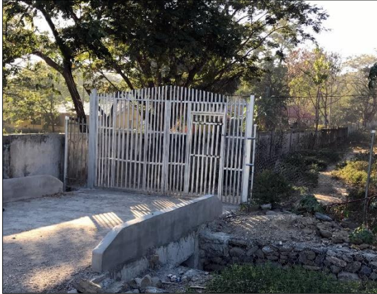
Second Gate and Bridge

stop animals entering KD. A side gate was provided for pedestrian access. This project has significantly improved the security of the compound and also ensured that animals cannot enter KD and destroy the vegetation. A second gate and bridge have also been constructed to provide access to the sports field and some buildings at the rear of KD.