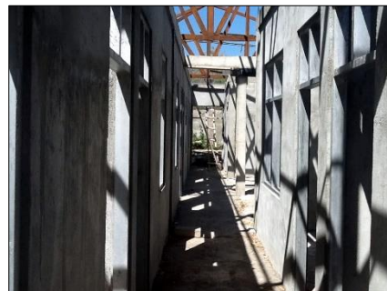
Cottage Four TB Ward