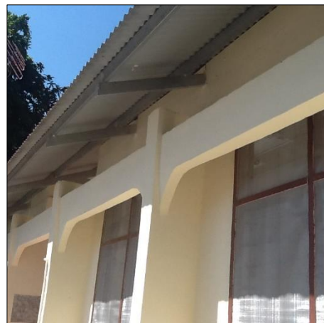
New Roof on Cottage Two