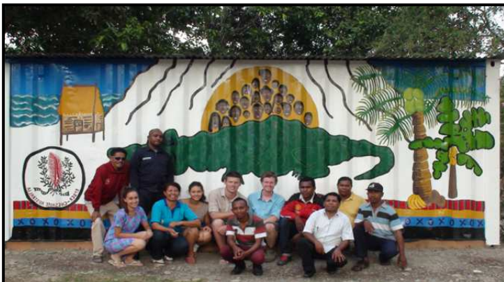
The 2014 restored container, Campion College Volunteers and Klibur Domin Staff

The residents are more content, and there is less aggression between them. It has been a challenge working with the nursing staff towards more patient-centred care, but the changes so far are very positive for residents and carers alike.