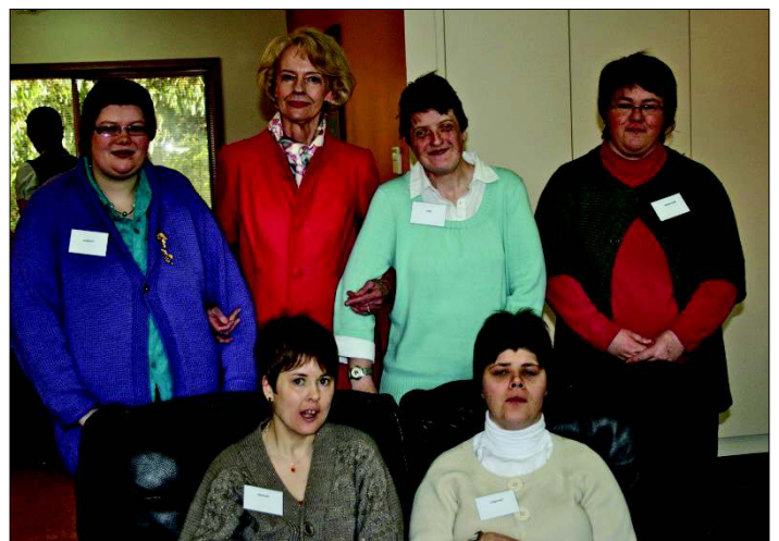
Picture above: Her Excellency Ms Quentin Bryce AC with the residents of the Mount Gambier Home.